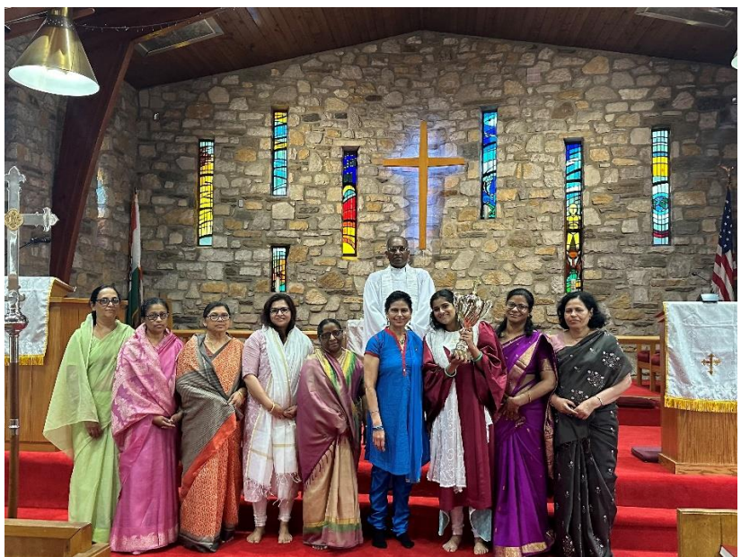
Congratulations to the Quiz Competition winners at the Regional Women & Laity Fellowship Retreat hosted by the CSI Malavalam Congregation of Greater New York. Seaford.